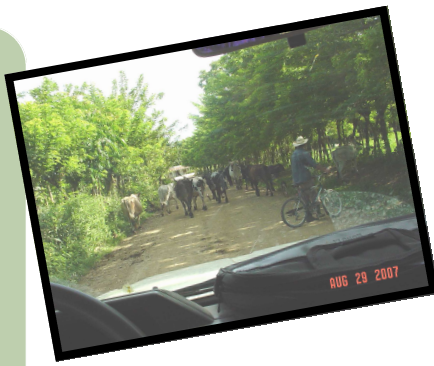
Traffic jam we encountered in La Ceiba, Honduras

June 22 @ 6 pm Fairview Baptist in Greer, SC