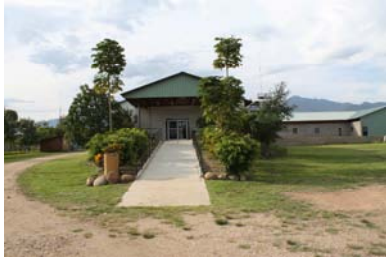
The front of Baptist Hospital of Guiamaca.