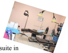
A surgical suite in Hospital Bautista

hospital with an emphasis on surgery where there was a chapel in the facility, and other associated ministries, such as a food program, and even a reforestation ministry. This is the same hospital. The call we received last Tuesday was about our coming to Honduras to visit Hospital Bautista, but this time with new eyes, eyes that would possibly be overseeing the management and direc-