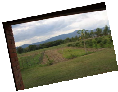
The vegetable garden and view from the back of the hospital property at Guiamaca.

15 The number of rules of the subjunctive tense in español—which we are studying now—muy diferente que inglés!