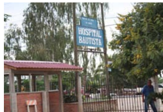
The sign translates, "For me, to live is Christ. Baptist Hospital"