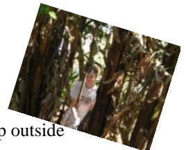
Cleaning up outside their house.

I'm so thankful that God has provided funds for this family to have their home rebuilt, and that I was able to help.