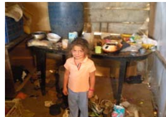
Sweet little girl, standing in front of her kitchen table.

really hard because it was . . .so poor. For example, one of the men with us was picking up his 17th TV of the day (the people who live there harvest TVs to sell the copper in them and then dump them near their houses). When he picked it up, he found a dead opossum in it, probably a meal for the dogs